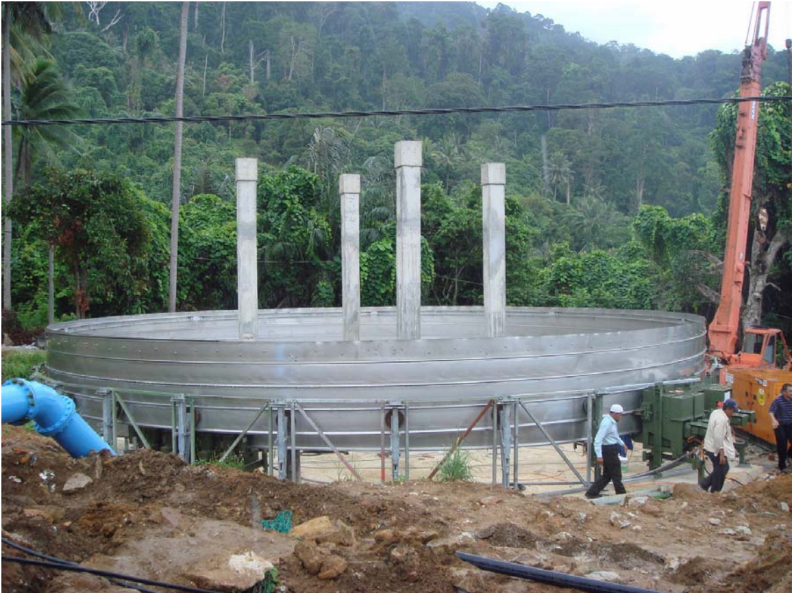
FIGURE 4.4 : STAINLESS STEEL RESERVOIR