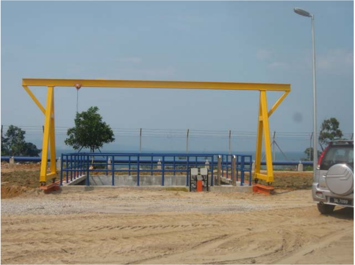
FIGURE 4.2 : Pump Sump