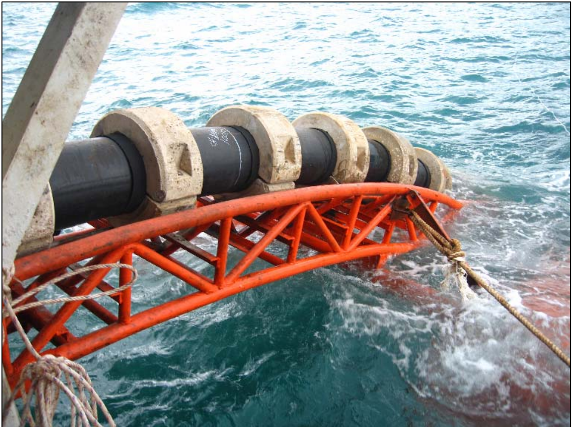
FIGURE 4.3 : CONCRETE COLLAR WEIGHT AND SUBMARINE PIPE ON STINGER