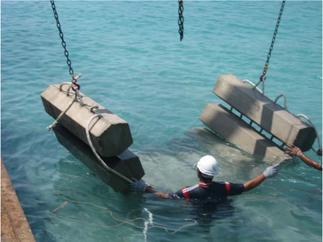
FIGURE 4.6 : CONCRETE MATTRESS