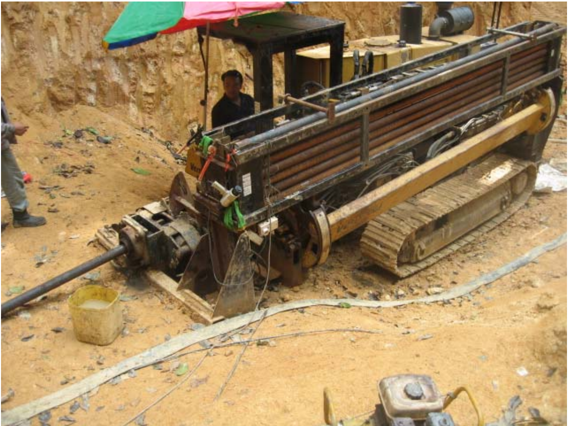
FIGURE 4.8 : HORIZONTAL DIRECTIONAL DRILLING